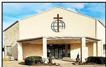
Same church two years after cleaning with Nano cleaner then sealed with BioDefense 24/7™